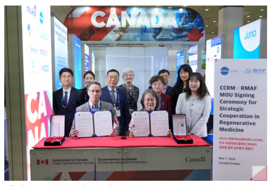
The Regenerative Medicine Promotion Foundation is taking a commemorative photo after signing a business agreement with the Canadian Centre for Regenerative Medicine Commercialization (CCRM) on May 7 (provided by the Regenerative Medicine Promotion Foundation)

2025-05-13 16:03 Source: Regenerative Medicine Promotion Foundation